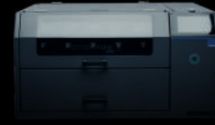
PRETREATmaker max 5